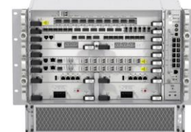
Nokia 1830 PSS-16II